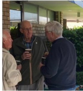
Photo from the Morning Teas